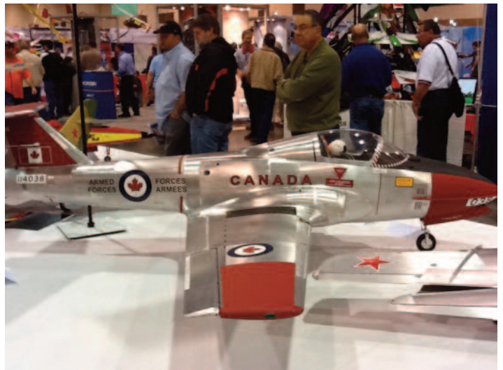
An excellent Avro Tutor with metal finish

Sunday started with a quick breakfast and another trip to the Seagate Center for another round before heading for home. After making a couple