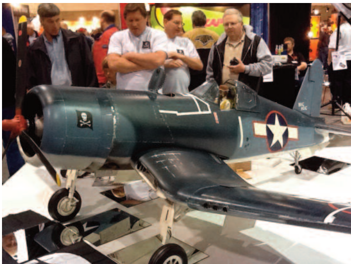
A CARF F4U Corsair with Moki 250 and folding wings