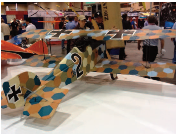
An extremely well done Aviatik D1